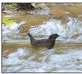
A brown dipper.

Still, the majesty of one of America's most picturesque national parks framed the moment, leading me to cherish this bird — one not native to the Cleveland, Ohio, region